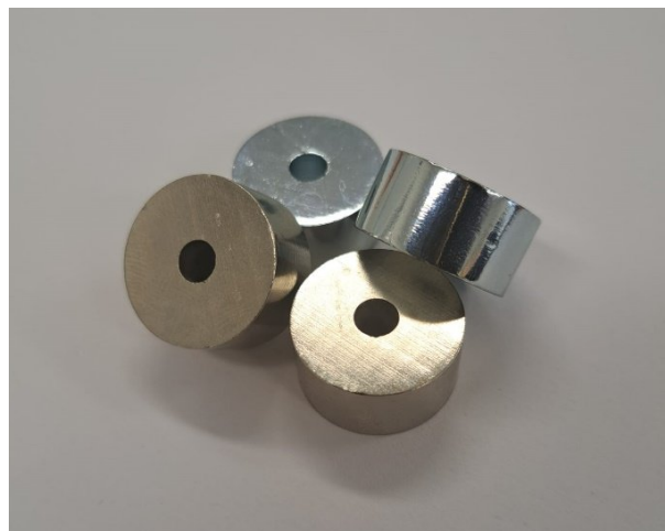
Left: Finished magnets for prototype demonstration in medical devices